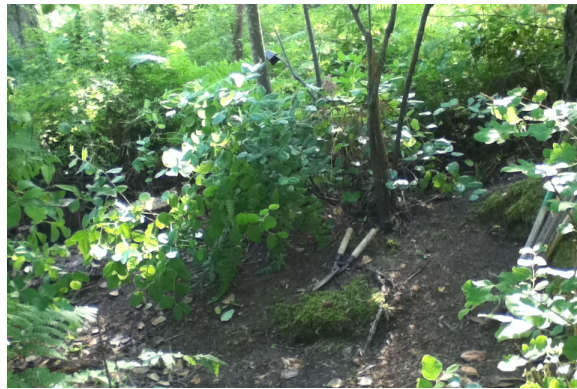
The newly renovated Sis N' Bro's

*Small Businesses and Animals Association