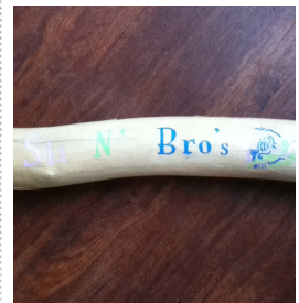
Nice new sign

Come to Sis N' Bro's and have nice drink. They have Sea Beer, Coffee, Tea and Salale Soda