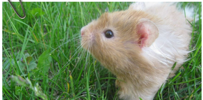
Sis N' Bro's mascot, Sniffles the hamster